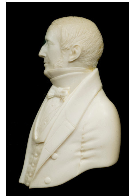
1&2. Matthew Flinders and Wife, Ann Chappelle , 1812 (1774-1814) (1770-1852)

Carved ivory Roy Morgan Research Centre collection