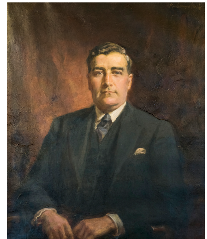
9. Rt. Hon. Sir Robert Gordon Menzies, KT AK CH FAA FRS, QC , 1932 (1894-1978) Sir John Campbell Longstaff, artist, (1861-1941) Oil on canvas Private Collection