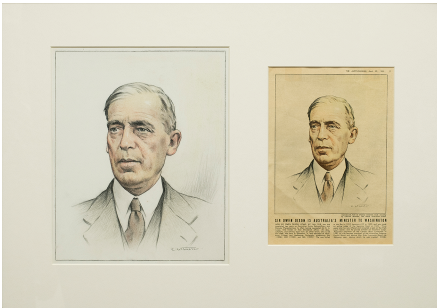
5. Hon. Sir Owen Dixon KCMG KC MA LLB , 1944 (1886-1972) Chief Justice of Victoria, 1952-1964 Australia's Minister to Washington, 1942-1944 Charles Arthur Wheeler, artist, (1880-1977) Portrait sketch Roy Morgan Research Centre collection