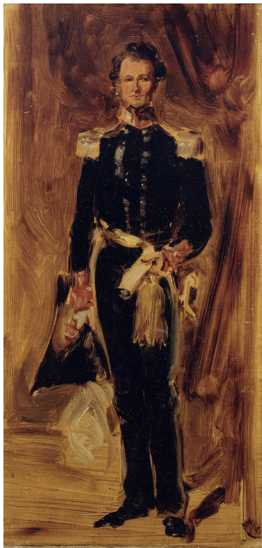
11. Charles Joseph LaTrobe—study, 1855 (1801-1875) Sir Francis Grant, RA, artist (1803-1878) Photographic copy of oil on canvas on stretcher