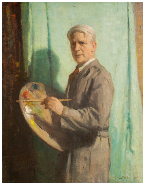
6. Charles Arthur Wheeler, OBE DCM , c 1950 (1880-1977) Self portrait Oil on board The Australian Club