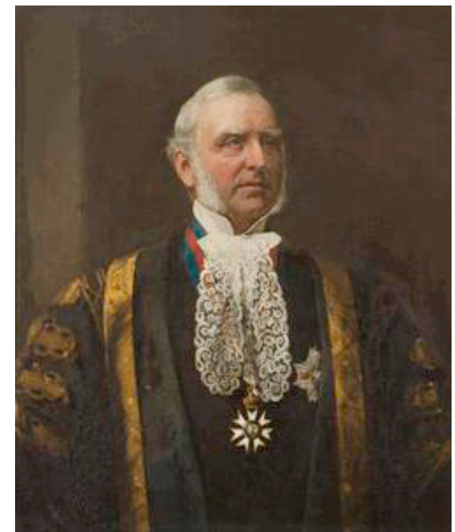
3. The Hon. Sir Redmond Barry, KCMG c 1874 (1813-1880)

Carved ivory Roy Morgan Research Centre collection