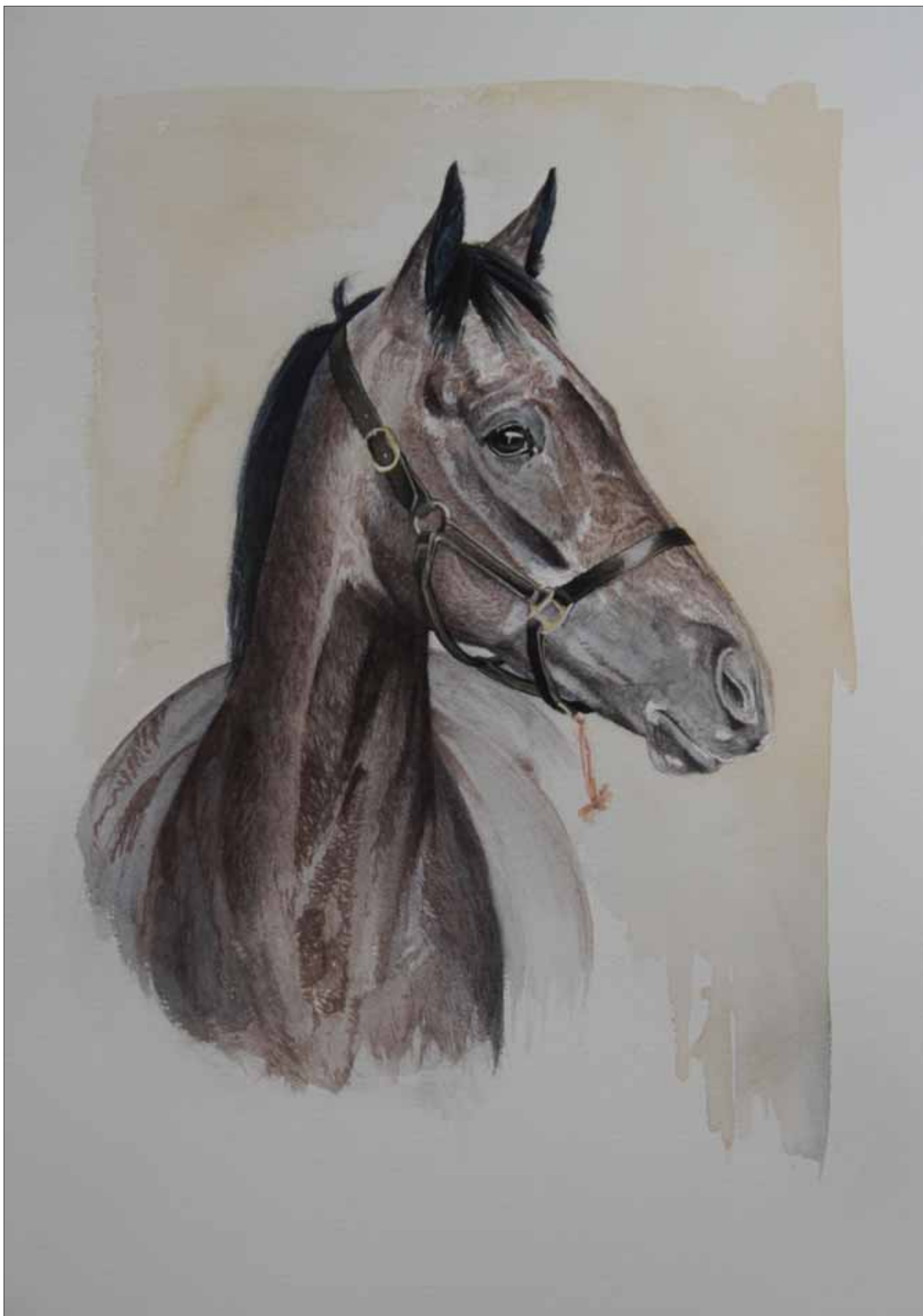
'Manighar', Winner 2012 Australian Cup ( watercolour )