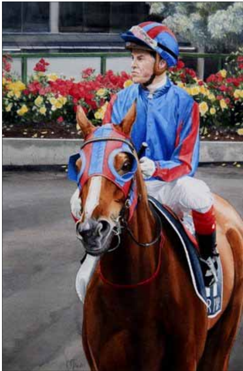
‘Her Greatest Day’, Pinker Pinker watercolour before her 2011 Cox Plate win.