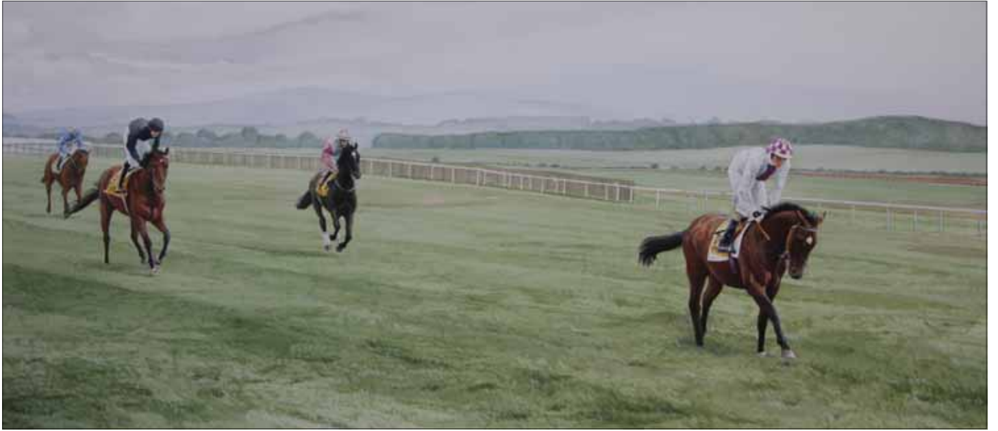
'Across the Curragh', Irish Derby Day, County Kildare. ( watercolour )