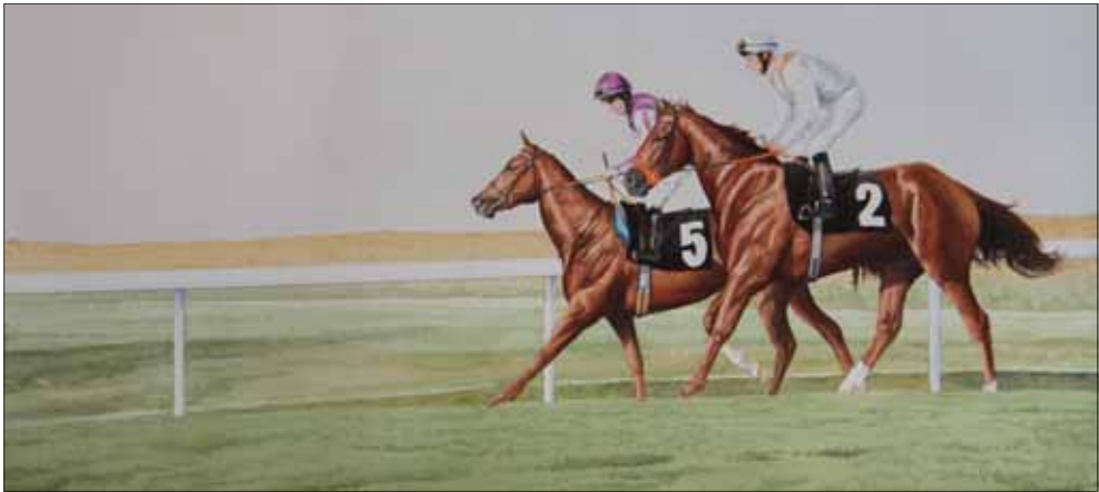
‘Riding Out’, Goodwood. watercolour