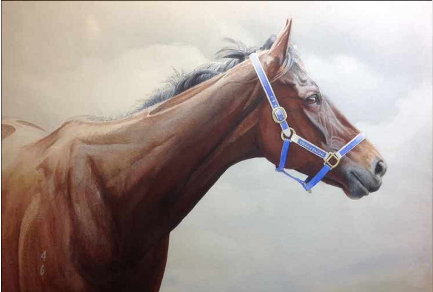
Nelly, 'Black Caviar'. (watercolour)