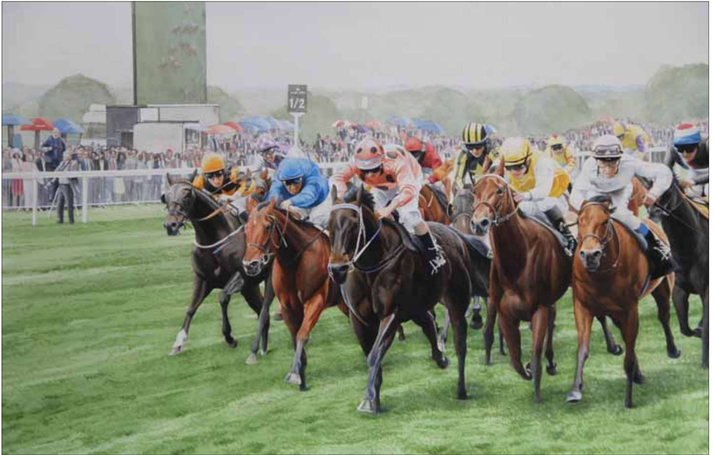
'By a Nose!', Black Caviar wins the Diamond Jubilee Stakes, Royal Ascot, 2012. ( watercolour )

Collins Street Gallery – October-November 2012