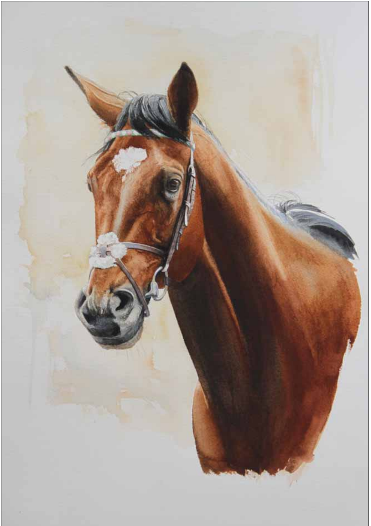
'Frankel', English Champion. ( watercolour )