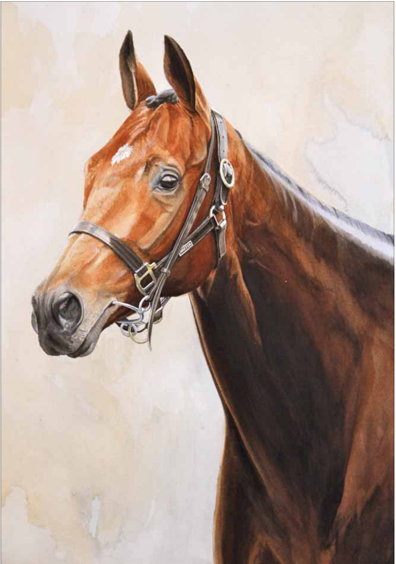
'Dunaden' Melbourne Cup winner, 2011. ( watercolour )