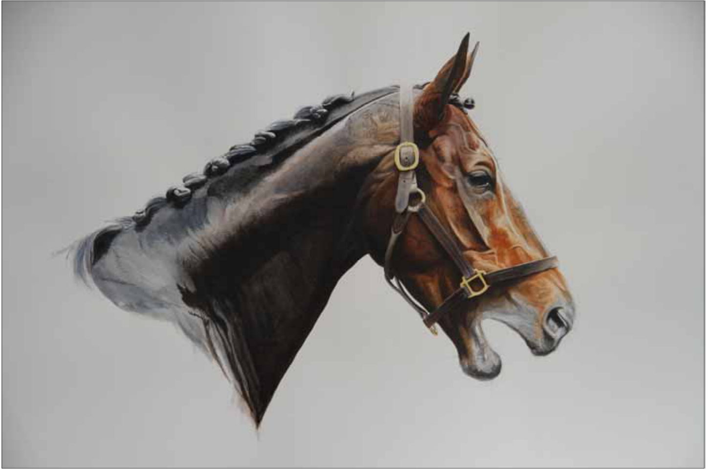
'Americain', Melbourne Cup winner, 2010. ( watercolour )