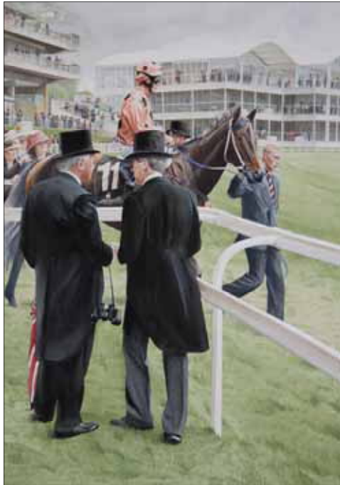
‘Onto the Hallowed Turf’, watercolour Black Caviar at Royal Ascot, June 23, 2012.

1991 – Lives and exhibits in London ( Medici Gallery , Mayfair). 1990 – Runner-up, R.S.P.C.A. Annual Art Show, Melbourne. ‘Best Work Depicting Exotic Wildlife’, WASA Annual Exhibition. 1989 – ‘Best Artist Under 25’, Waverley City Art Show. ‘Best New Artist’, Wildlife Art Society of Australasia Annual Exhibition. 1988 – Works as on-site artist, World Expo 88, Brisbane, Australia. 1987 – Completes Applied Art course at RMIT. RMIT buys two drawings at end of year student exhibition.