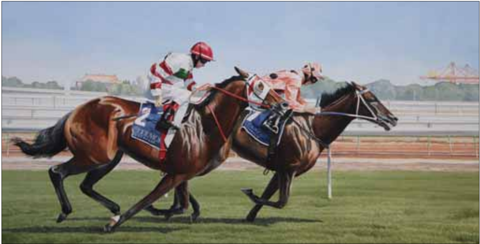
‘Duel in the Sun’, Black Caviar and Hay List, The Lightning Stakes, Flemington, 2012. watercolour