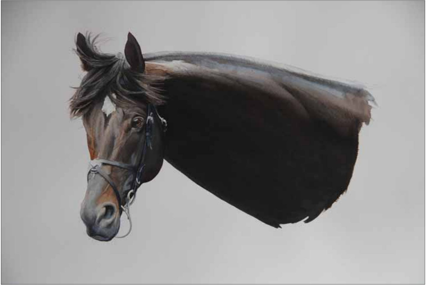
'So You Think', Cox Plate winner, 2009, 2010. ( watercolour )