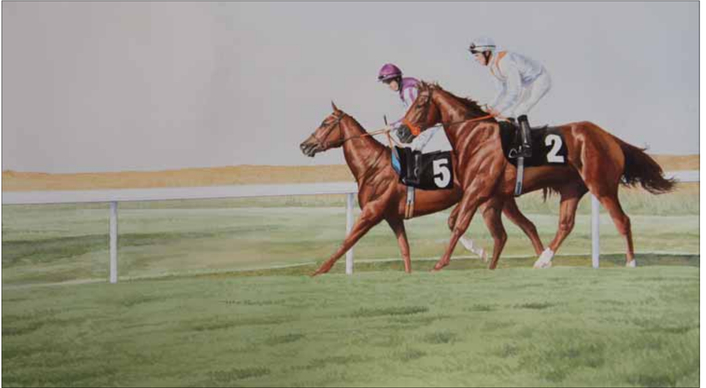
Riding Out', Goodwood. (watercolour)