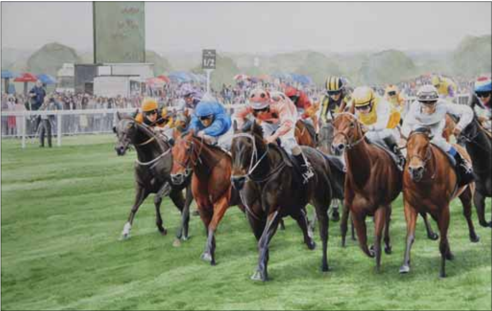
‘By a Nose!’, Black Caviar wins the Diamond Jubilee Stakes, Royal Ascot, 2012. watercolour