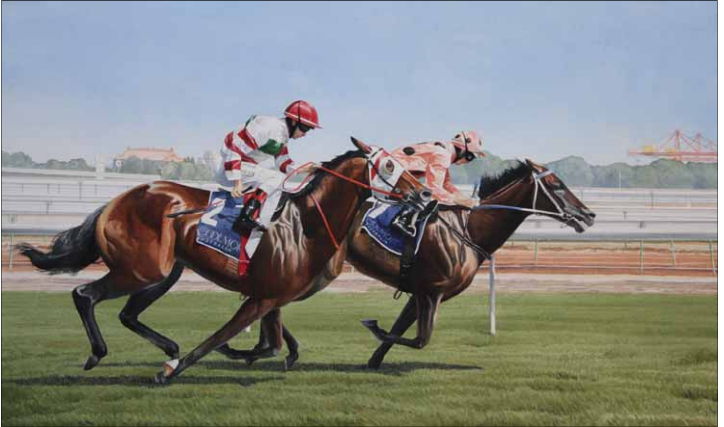
'Duel in the Sun', Black Caviar and Hay List, The Lightning Stakes, Flemington, 2012. ( watercolour )