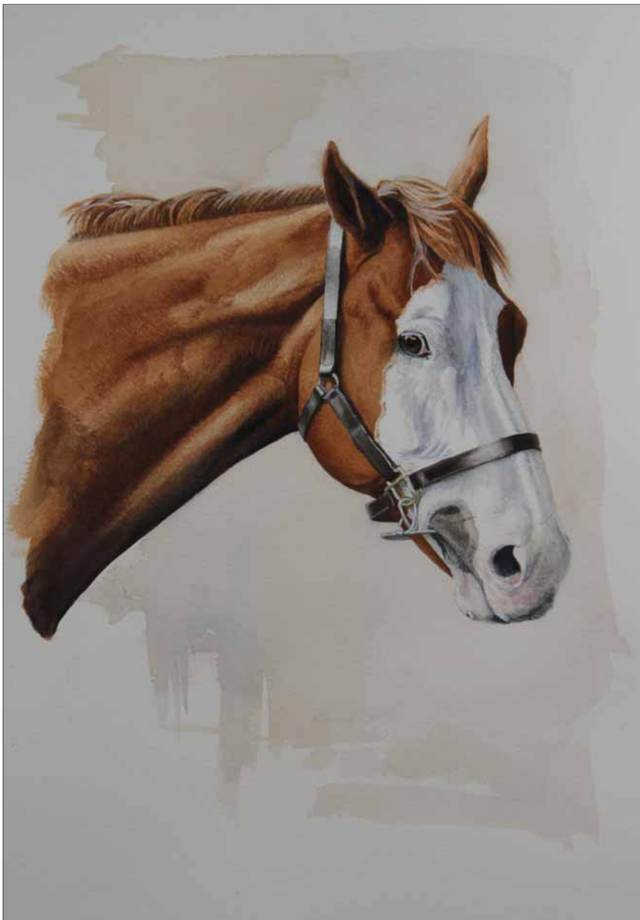
'Apache Cat', Retired Champion. ( watercolour )